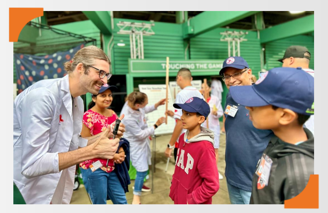
Read our ESG report at collegiumpharma.com.

Collegium is a proud partner of the Boston Red Sox , collaborating with Science from Scientists to inspire hundreds of kids and their families through STEM experiments at select home games.